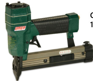
OMER R1.25P 18Ga Pin Nailer