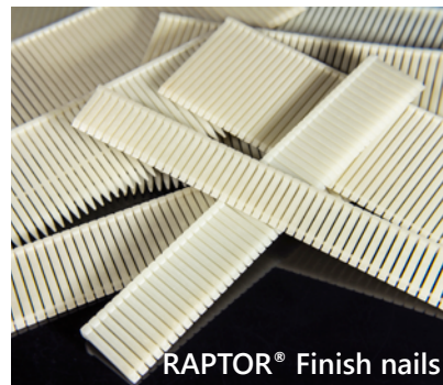
RAPTOR® Finish nails