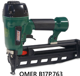
OMER B17P.763 Finish Nailer