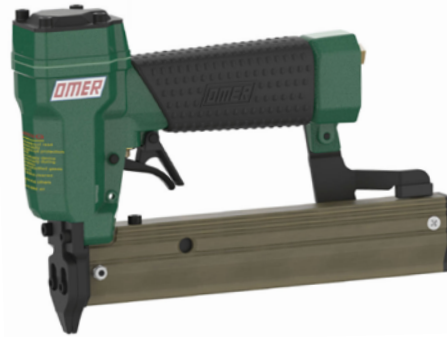
OMER 12P.25 Brad Nailer

Packaging: 2000 nails per box • 32 boxes per case