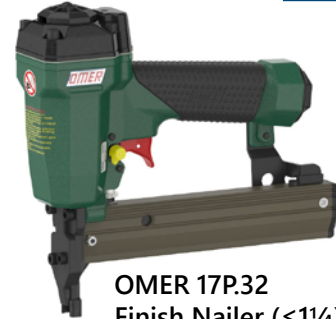
OMER 17P.32 Finish Nailer (≤1 1/4)

Packaging: 2350 nails per box • 16 boxes per case