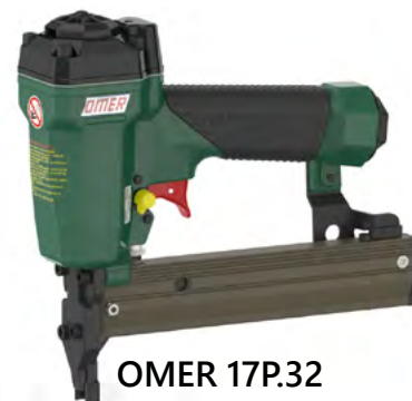
OMER 17P.32 Finish Nailer (≤1 1/4)