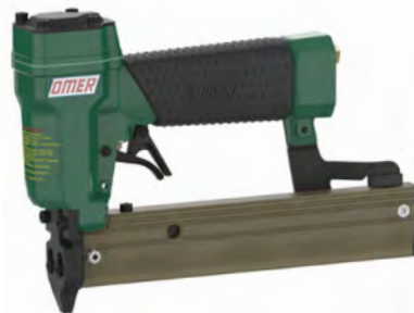
OMER 12P.25H Brad Nailer