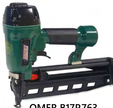
OMER B17P.763 Finish Nailer