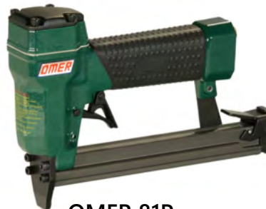
OMER 81P Series Stapler