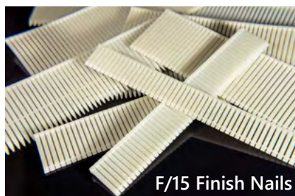
F/15 Finish Nails